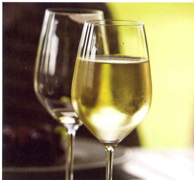
A Western barbecue at 3 Creek Ranch.