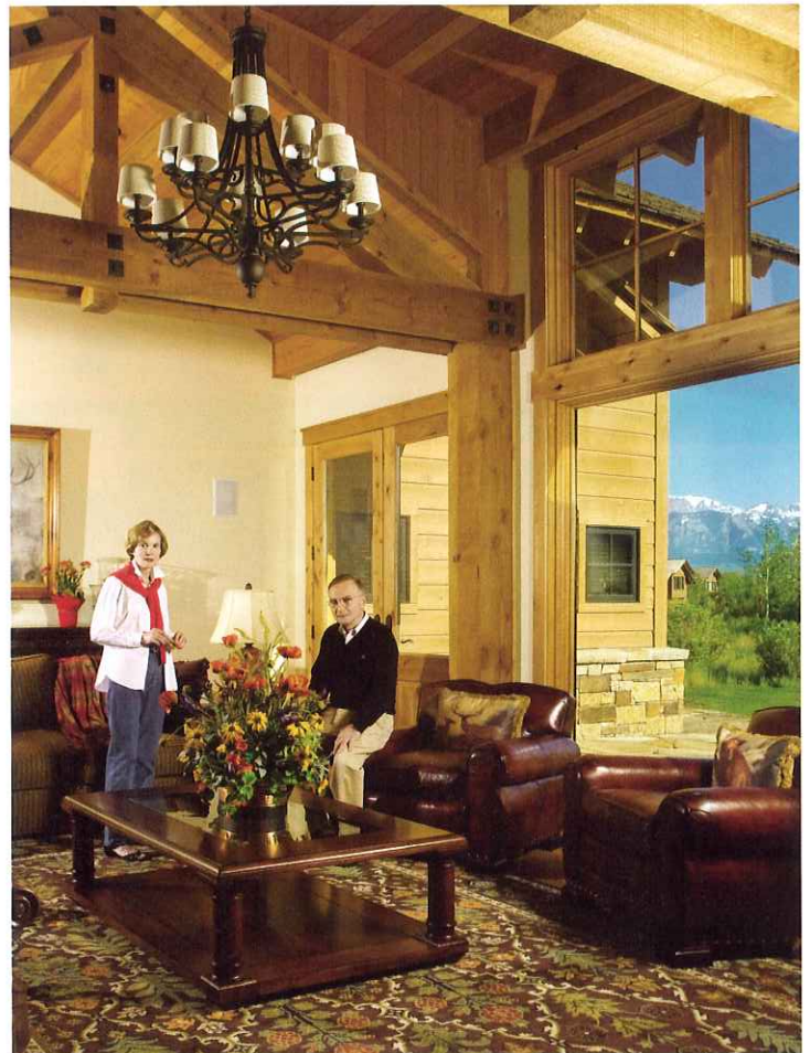
Nancy and Vince Borelli's home in 3 Creek Ranch emphasizes Western with a touch of Naples, with its open plan focusing on surrounding mountain views.